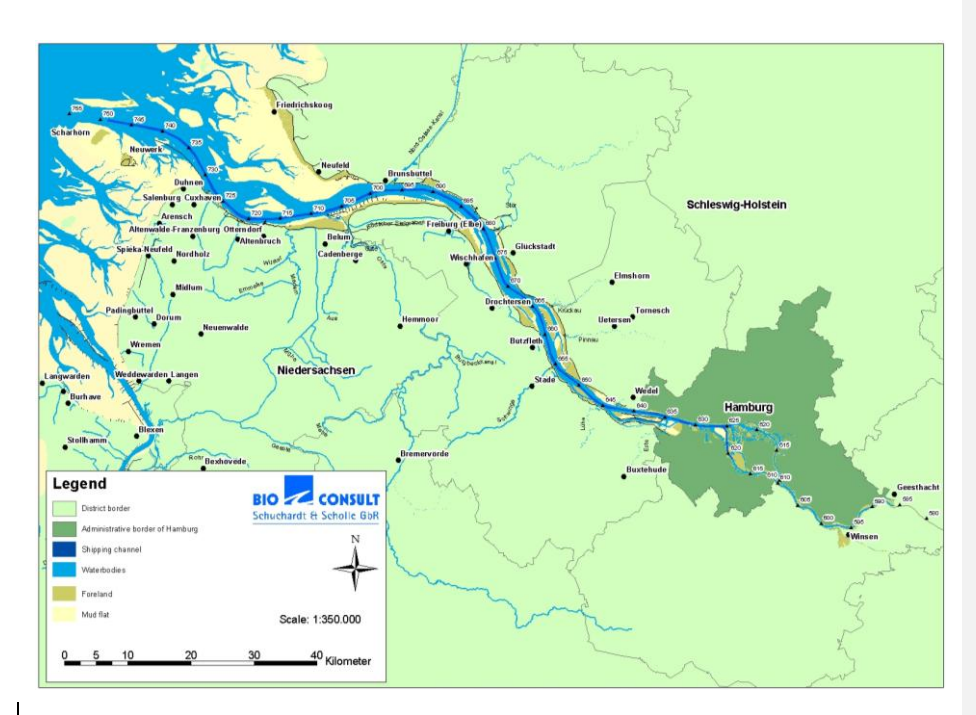
Fig. 22: Overview of the Lower and Outer Elbe with kilometrage.